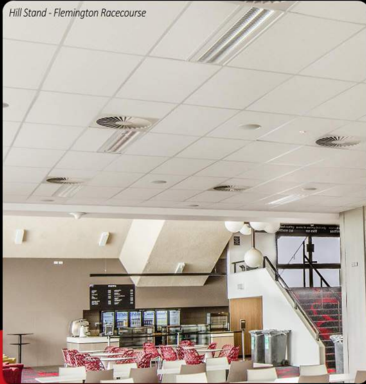
Hill Stand - Flemington Racecourse