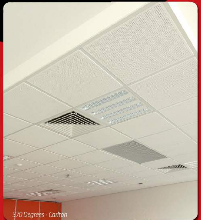
370 Degrees - Carlton