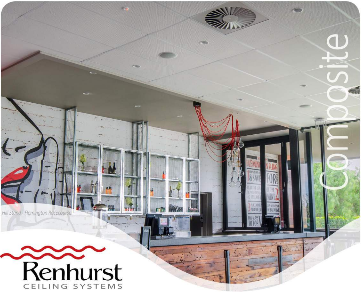
Hill Stand - Flemington Racecourse