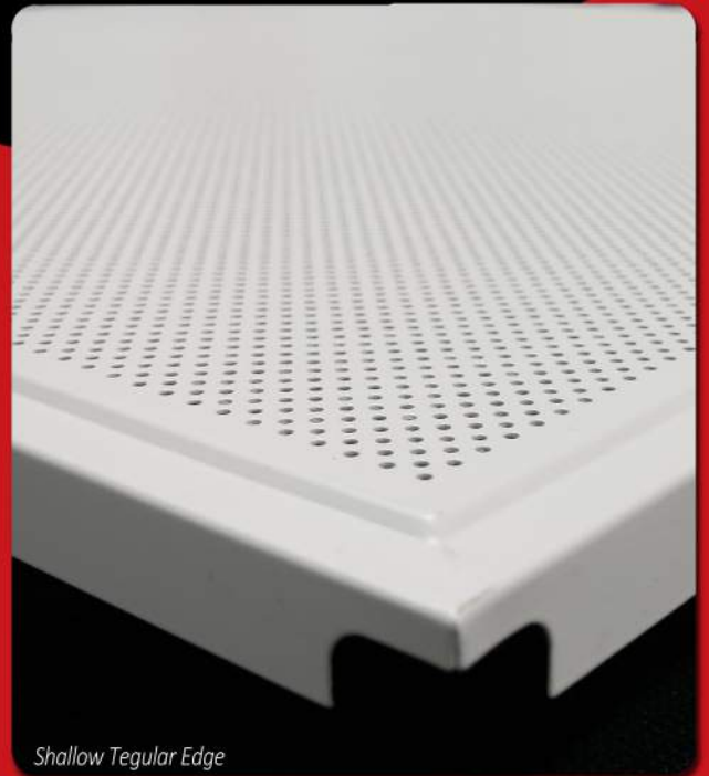
Shallow Tegular Edge