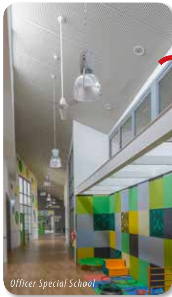
Officer Special School