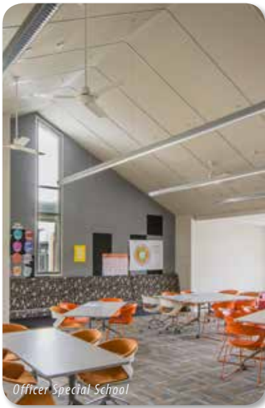
Officer Special School